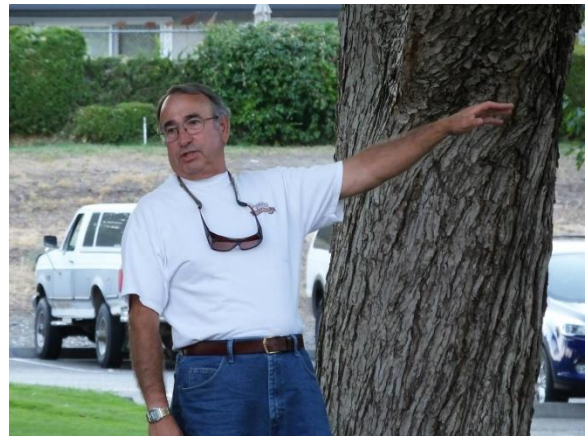
Get your stories ready for the liars challenge, there are always a few fish tales told, share them with the club.

We have several volunteers to set-up and cook but we can always use more. If you can assist, please be at the picnic location by 4:30 PM on the 1st. Be there and bring chairs.