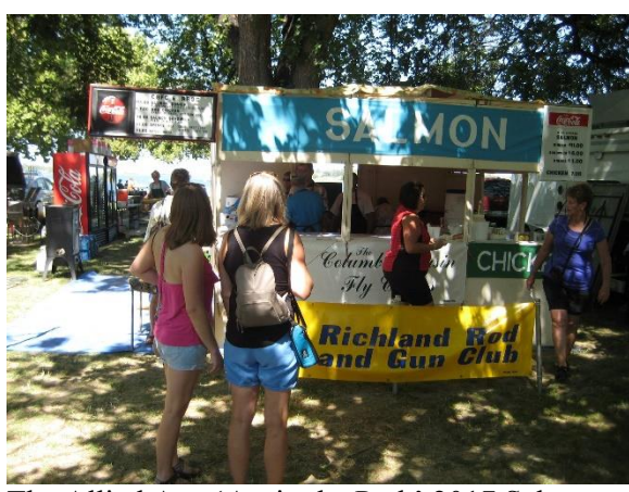
The Allied Arts 'Art in the Park' 2017 Salmon Booth will take place Friday and Saturday, July 28 and 29 at the usual location in Howard Amon Park in Richland. This is the main money raising project of the Richland Rod & Gun Club and The Columbia Basin Fly Casters for the year.