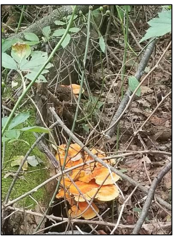
(Chicken of the Woods)

(Dave Myers with a 20 in. Largemouth Bass caught at Thompson Seeps while bluegill fishing 7/31/20)