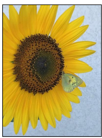
(Clouded Sulphur Butterfly)

FAUNA AND FLORA SURVEYS: Some members of the RRGC have been out and about collecting photos of native species. Send your photos to the secretary for next month. Quite a few members have been shared already and I appreciate the efforts. Did you happen to get a good shot on your trailcam? Out the window with a phone camera of a herd on a hillside? Send them in. hunting camp, backpacking trails, fishing on the jetty with your life long partner. Even laying a trap line with your kids in the great outdoors! All of those shots qualify.