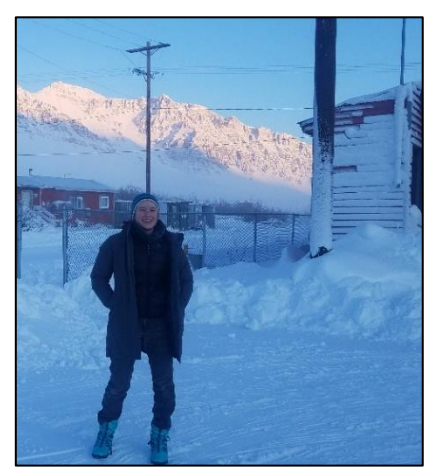
(Me in -50 degrees)

(Anaktuvuk Pass resident modeling her parka)