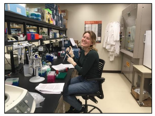
(Where most of my research time is spent, the lab!)

(A trapper holds up a wolverine fur after a successful trapping season)