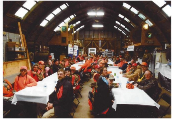
Youth Pheasant Hunters