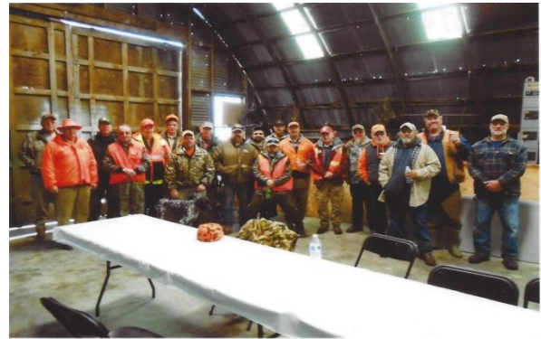
Youth Pheasant Hunt Volunteers